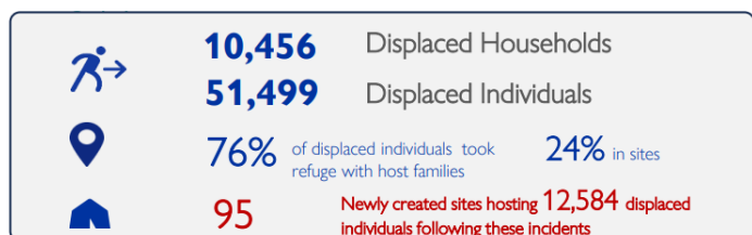
Figure 2: ETT 61.2, IOM, April 17, 2025.

A total of 51 499 people have been newly displaced following the gang attacks in Mirebalais on March 31, 2025.